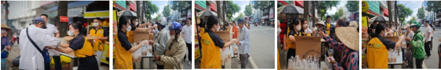
FOOD & DRINK DONNATION AT SPECIAL OCCASSIONS