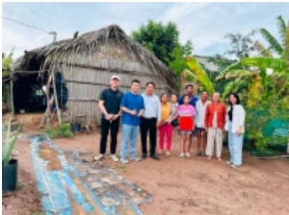
HANDOVER OF HAPPI HOUSE NO. 2 (JULY 2024)