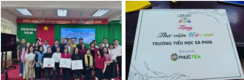
HANDOVER OF A LIBRARY TO A PRIMARY SCHOOL IN THE HIGHLANDS - SA PHIN SCHOOL - HA GIANG - VIETNAM