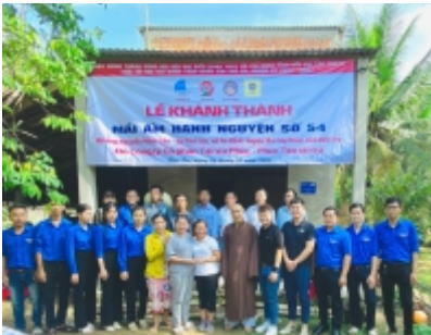
HANDOVER OF HAPPI HOUSE NO. 1 (OCTOBER 2022)