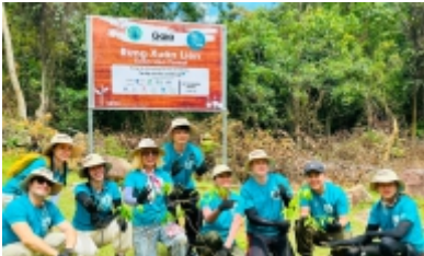
TREE PLANTING ACTIVITY AT XUAN LIEN NATIONAL FOREST